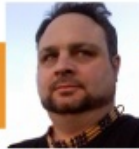
Roaming Buffalo Wabanaki Indigenous Talking Circle Keeper