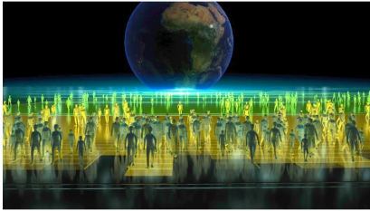
A scene from the documentary "Breaking Boundaries: The Science of Our Planet."